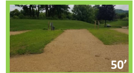
#A4-Old Mill Pond Park