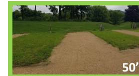
#A3-Old Mill Pond Park