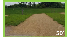
#A2-Old Mill Pond Park