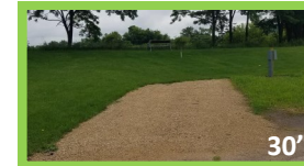
#A1-Old Mill Pond Park

Two free daily pool passes to the Woodman Aquatic Center are included with every campsite reservation!