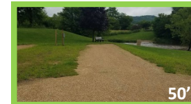
#A5-Old Mill Pond Park